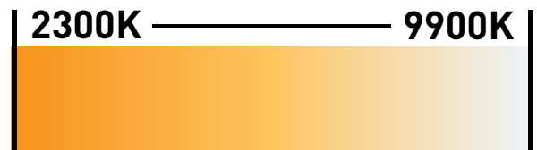
LINEAR COLOR TEMPERATURE CONTROL (TUNABLE WHITE)