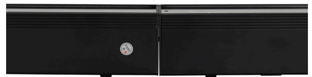
Horizontal Magnetic Alignment feature to lock fixtures together for seamless color output