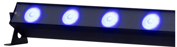
With 20° Diffusion Filter on fixture.