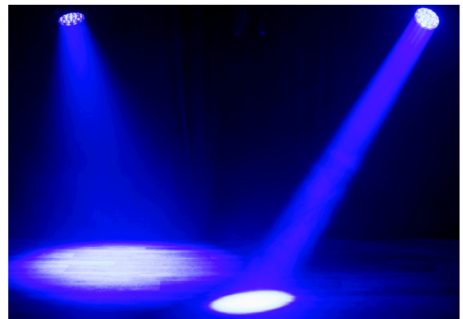
Beam or Wash Effects (Motorized Zoom: 9 ~ 60°)