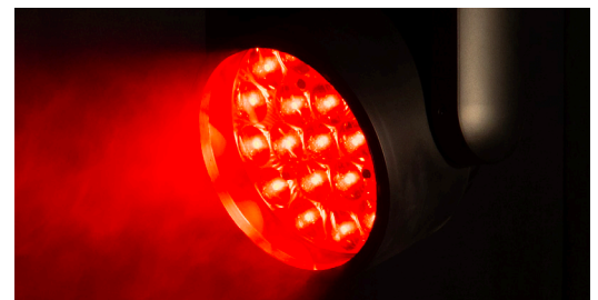
Beam & Wash Effects (Motorized Zoom)