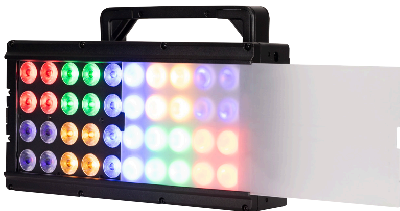
Removeable Frost Filter