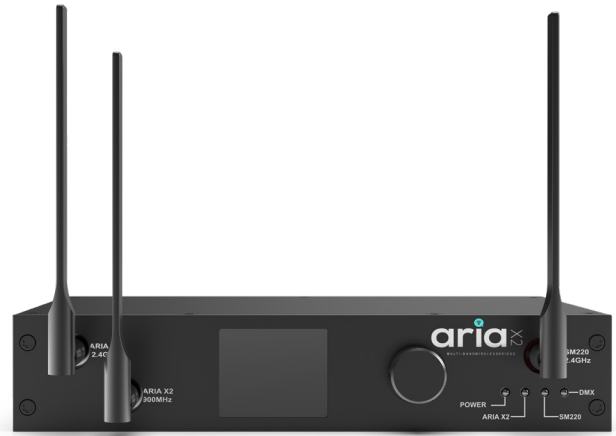
Aria X2 Bridge

Aria, the future of wireless lighting management, is here to transform your experience with unparalleled control, efficiency and ease. This comprehensive system harnesses cutting-edge technology to offer you a solution that adapts to your needs and provides a harmonious lighting experience, whether on show site or in the shop.