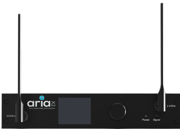
Aria X2 Transceiver

Introducing the Aria Wireless Management System for Advanced Lighting Control at the Shop or in the Show