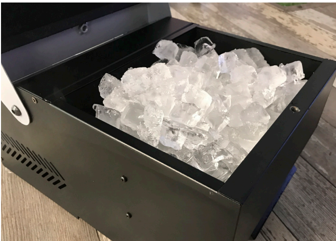
Uses Standard Water Based Fog Juice and Ice Cubes, Load up to 4 Pounds of Ice in the Chiller Box

Always be sure to maintain an adequate supply of ADJ® Brand Fog juice™ in the fluid reservoir. Running the fog machine dry will cause pump failure and or clogging. This is the most common cause of failure in fog machines.