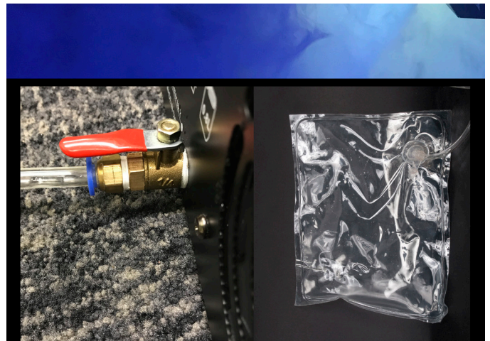
Water Drainage Valve System Allows for Easy Clean-Up. Water Drains Directly into the Provided Plastic Bag