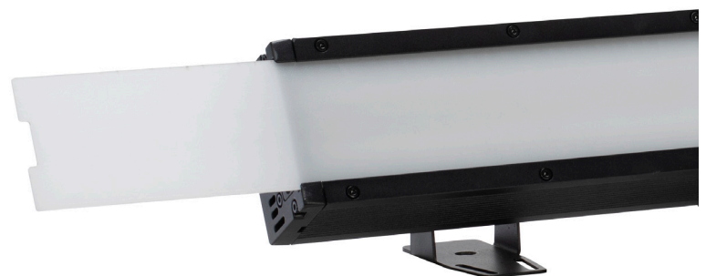
Removable frost filter